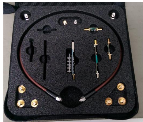
PCK01 High Performance Cable and Connector Kit

Picotest provides products that are designed to simplify measurements while providing the ultimate resolution and fidelity.