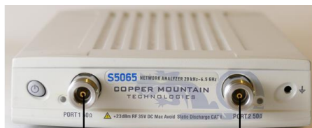
Copper Mountain VNA S5065

A known 1 mΩ resistor measured using 2-port shunt-through impedance measurements using the Copper Mountain S5065. The J2102B removes the ground loop error in 2 port shunt-through impedance measurements.