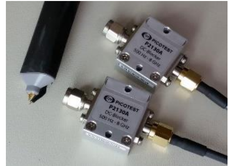
P21B01 PDN Probe Bundle and DC Blocks (2-Port Probe shown)