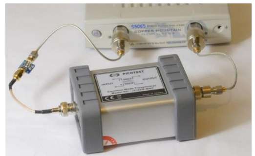
2-Port Shunt-Through test setup using the Copper Mountain S5065 and the J2102B-BNC